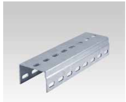
For profile Q100