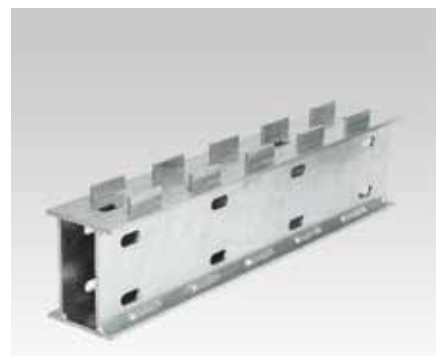
For profile Q150