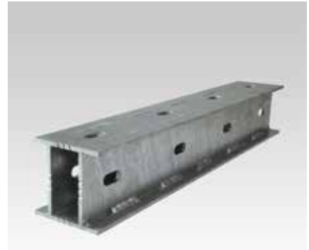
For profile Q80