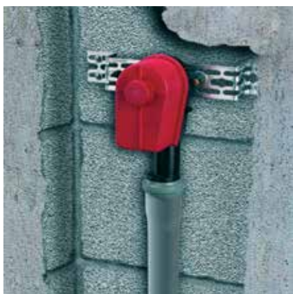
Installation in a wall: Waste pipe of washing machine