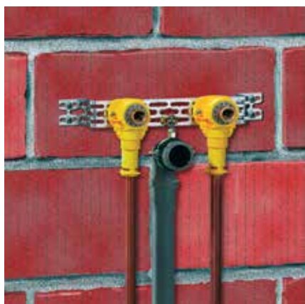
Washbasin installation: Everything fitted exactly to gauge