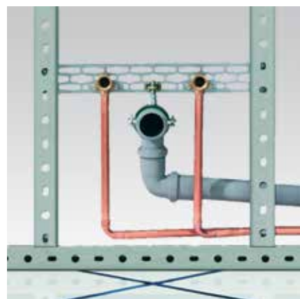
Wall-mounted installation: Wall-mounted installation using StaboFix® with MPC-Support channels