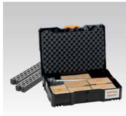
StaboFix® Economy set