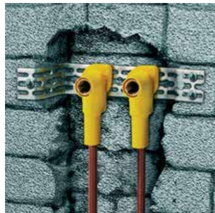
Washbasin installation: Installation in tight wall recesses