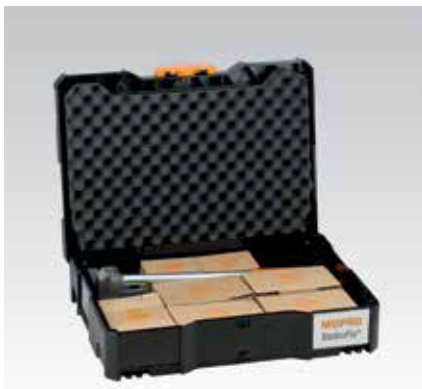
StaboFix® Plumbers case