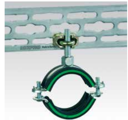
For the fixing of syphon bends and cross-running pipes – simple height adjustment