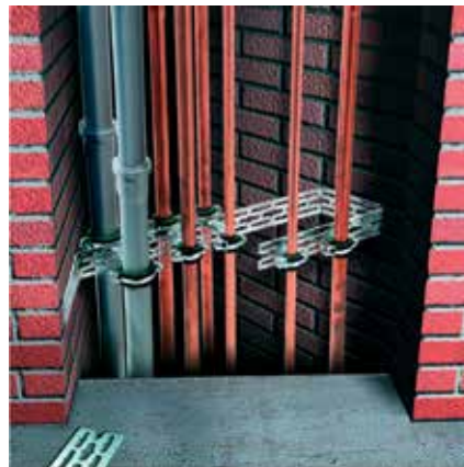
For simple, quick and secure fixing of pipe clamps with connection threads M8 and M8/M10