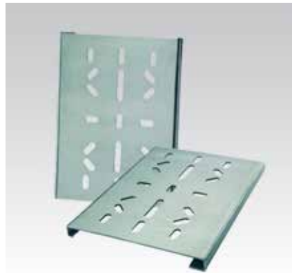
StaboFix® Retaining plate