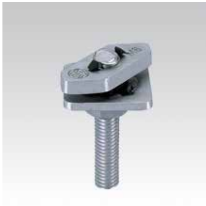
For profiles 27/18 and 28/30