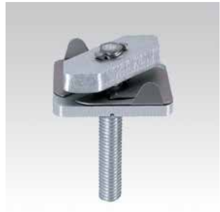
For profiles 38/24 to 40/120