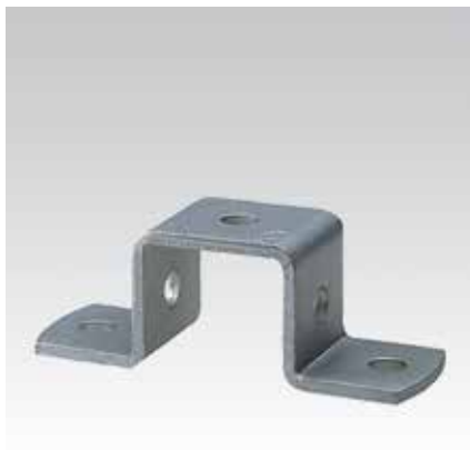
For profile 38/40