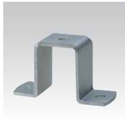
For profiles 40/60, 40/80 and 40/120