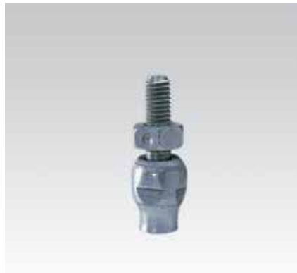
Swivel hanger, short