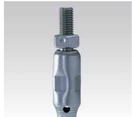
Swivel hanger, long