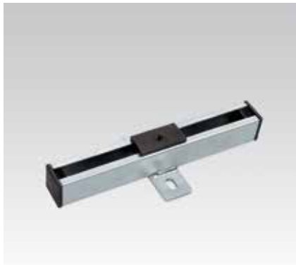
Guide rail M8