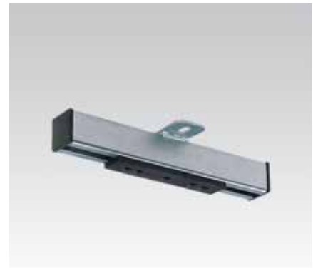
Guide rail M10