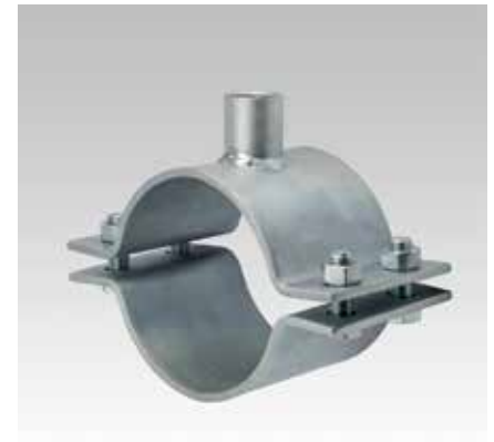
Anchor point pipe clamp 120 x 6