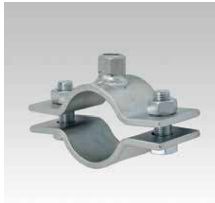
Anchor point pipe clamp 60 x 6