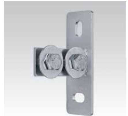
MPC-Channel support bracket, lengthwise