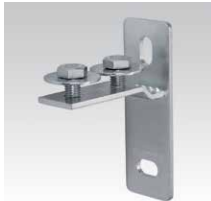
MPC-Channel support bracket, crosswise