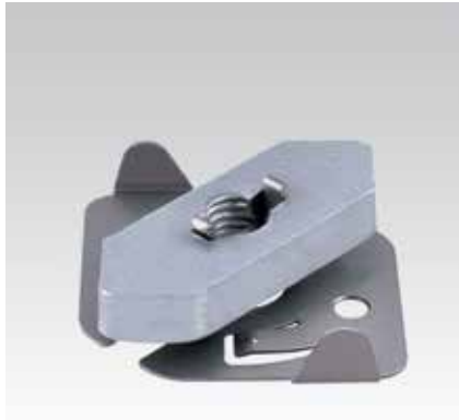
For angle mounting