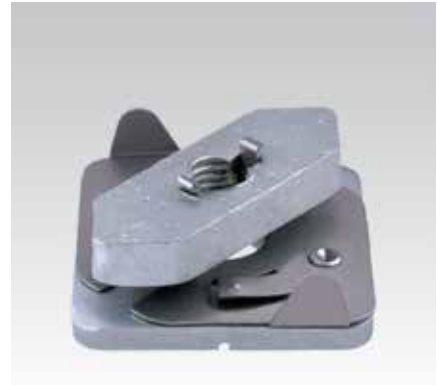
With internal thread