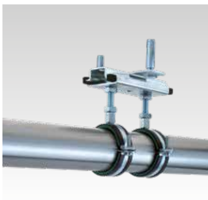
Ceiling installation with steel anchors M8