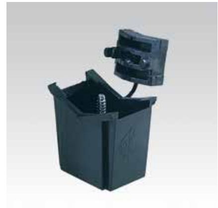
Universal nameplate support