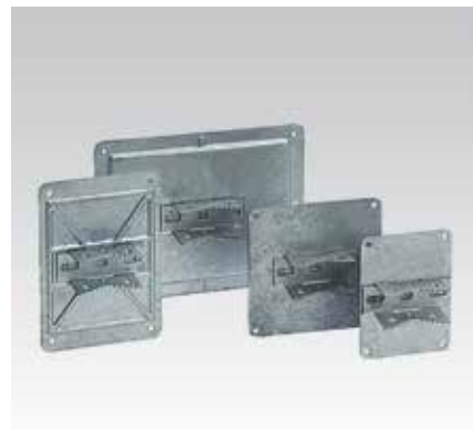
For channels 38/24 to 40/120