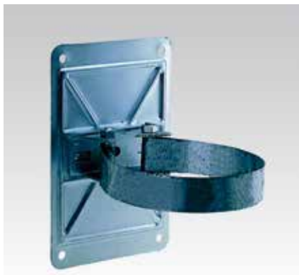
Installation with ML-Strap clamps