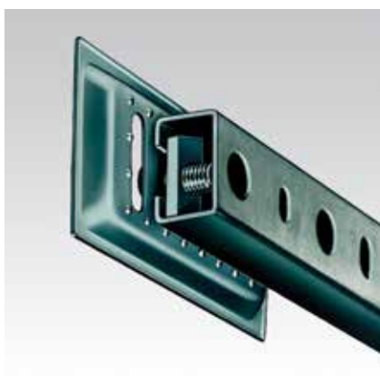
Adjustment pimples on the rear side ensure exact alignment of the linear mounted bases on a MPC-Support channel