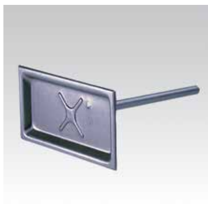
Mounting base with welding pin