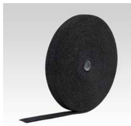
Hook & loop strip