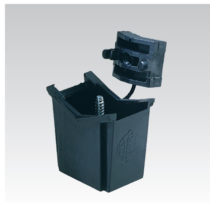
Universal nameplate support