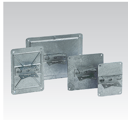
For profiles 38/24 to 40/120