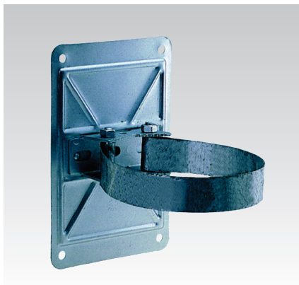
Installation with ML-Strap clamps