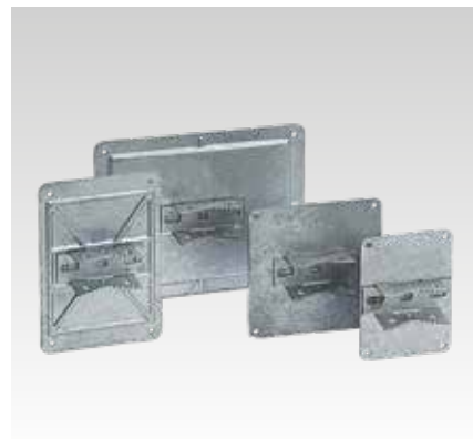
For profiles 38/24 to 40/120