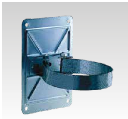
Installation with ML-Strap clamps