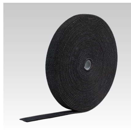
Hook &amp; loop strip