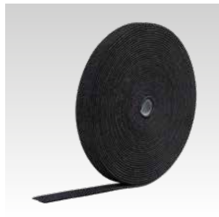
Hook &amp; loop strip