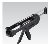
Cartridge gun Profi