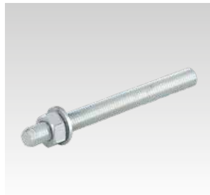
Anchor rod for solid and perforated blocks type VMU-A, strength class 5.8