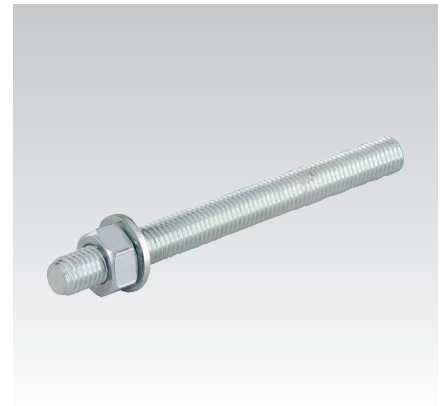
Anchor rod for solid and perforated blocks type VMU-A, strength class 5.8