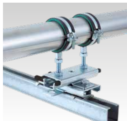
Upright installation of two slide guides in crisscross arrangement, on a MPC-Support channel