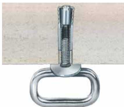
Fixing with steel anchor