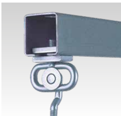
Attachment on a MPC-Support channel