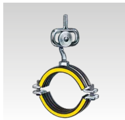
Sliding stirrup in combination with a single bossed clamp