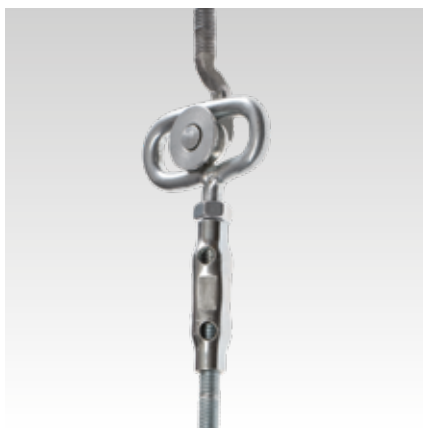
Sliding stirrups XL