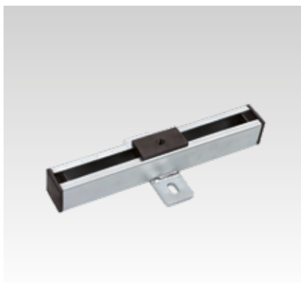
Guide rail M8