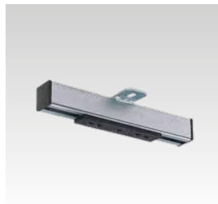
Guide rail M10