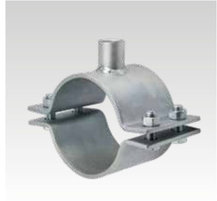
Anchor point pipe clamp 120 x 6