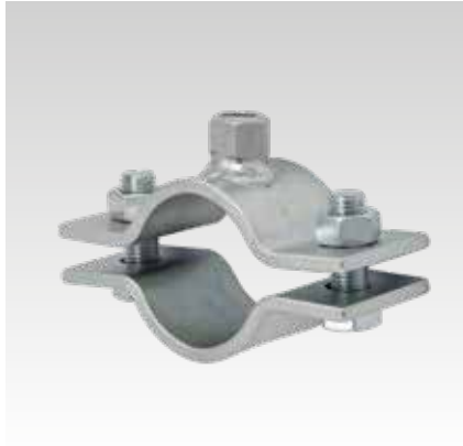
Anchor point pipe clamp 60 x 6