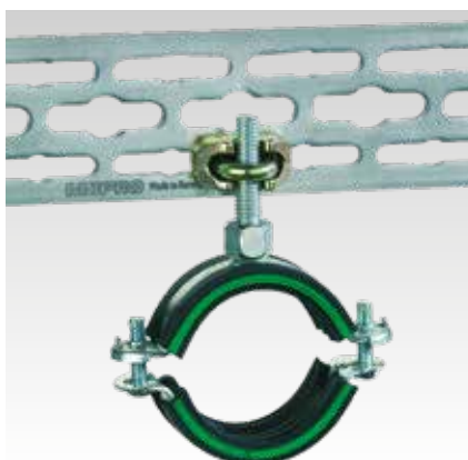
For the fixing of syphon bends and cross-running pipes - simple height adjustment