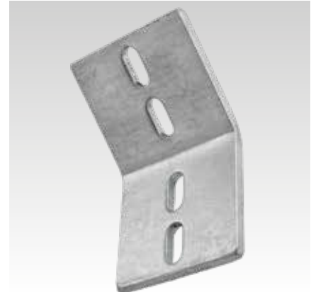
4-hole, for profiles Q50, Q100, Q150