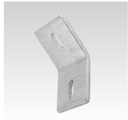
2-hole, for profile Q80