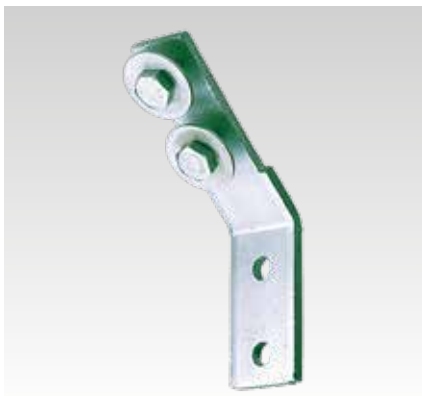
Mounting angle 45°