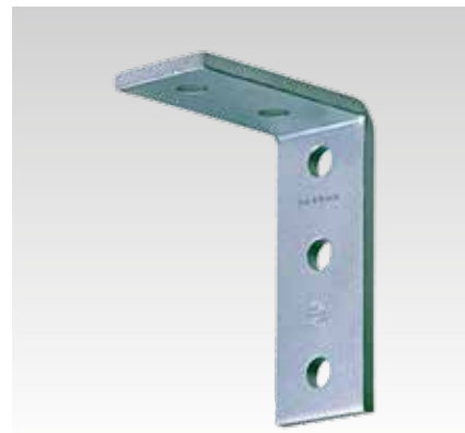
Mounting angle 90°