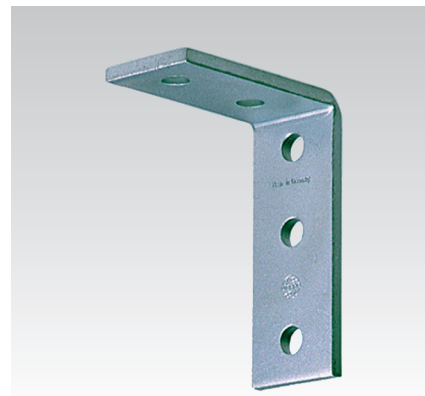
Mounting angle 90°