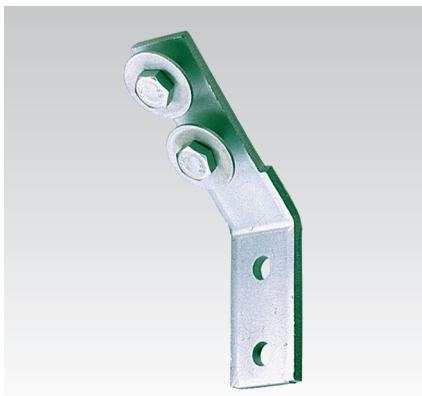
Mounting angle 45°