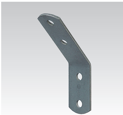
Mounting angle 45°