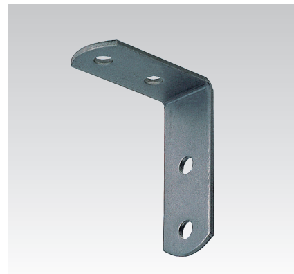
Mounting angle 90°