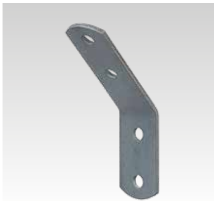
Mounting angle 45°