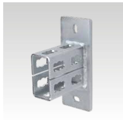
MPR-Saddle support type S+ for profiles 41/82 and 41/124