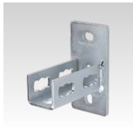
MPR-Saddle support type S+ for profiles 41/41 and 41/62