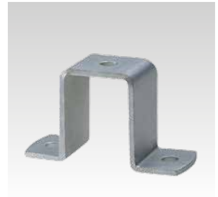
For profiles 40/60, 40/80 and 40/120