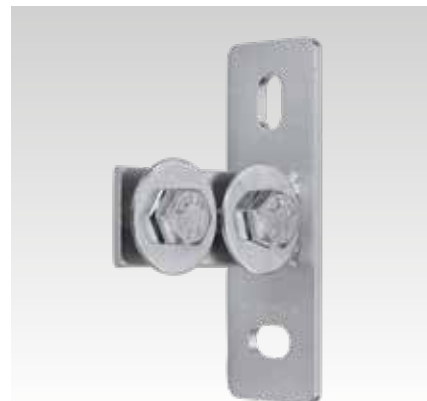
MPC-Channel support bracket, lengthwise