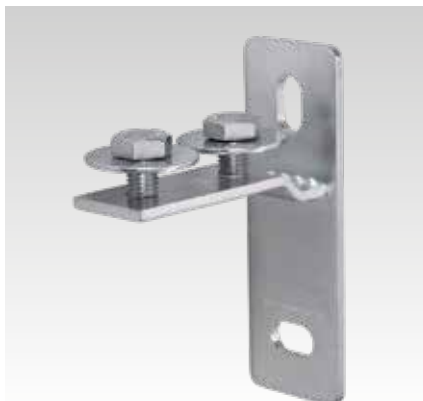
MPC-Channel support bracket, crosswise