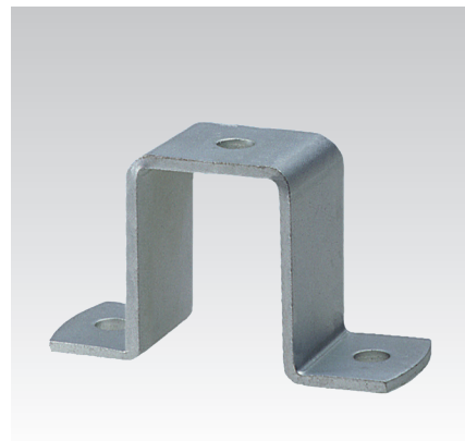
For profile 40/60