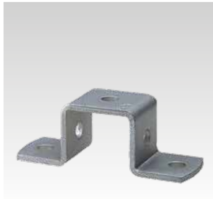
For profiles 28/30 and 38/40