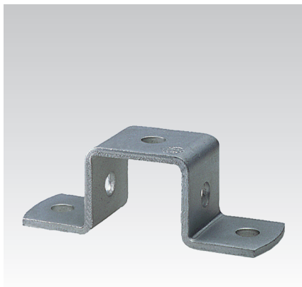
For profiles 28/30 and 38/40