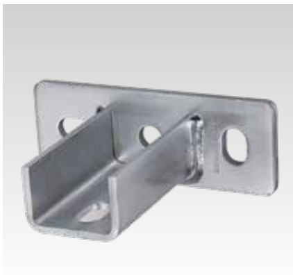
MPC-Saddle support, crosswise