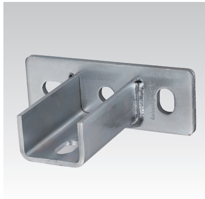
MPC-Saddle support, crosswise