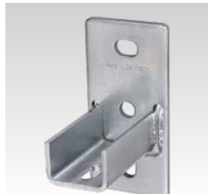
MPC-Saddle support, lengthwise