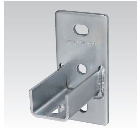
MPC-Saddle support, lengthwise