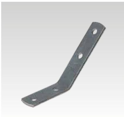
Mounting angle 45°