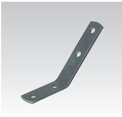
Mounting angle 45°