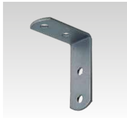
Mounting angle 90°