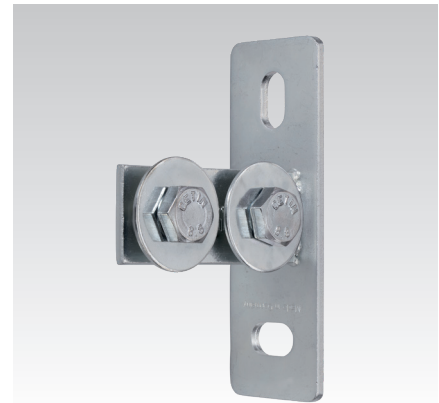
MPC-Channel support bracket, lengthwise