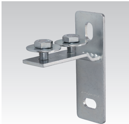
MPC-Channel support bracket, crosswise