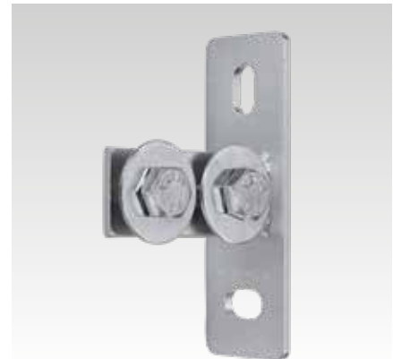
MPC-Channel support bracket, lengthwise