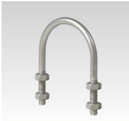
Versions M16 to M20 with nuts