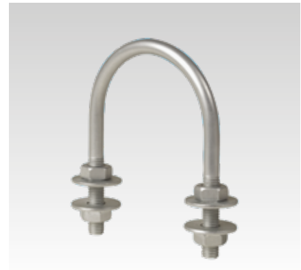
Versions M8 to M12 with nuts and washers