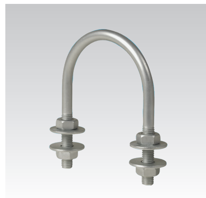
Versions M8 to M12 with nuts and washers