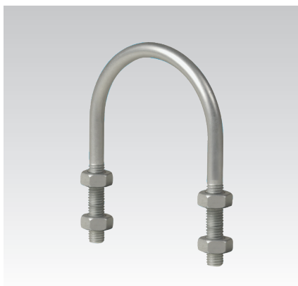
Versions M16 to M20 with nuts