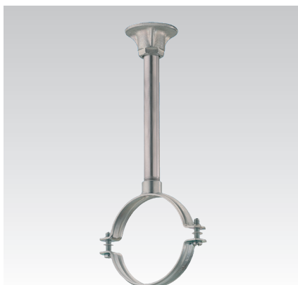
Mounting as anchor assembly with pipe nipple and single bossed clamp with connecting socket