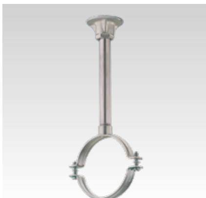
Mounting as anchor assembly with pipe nipple and single bossed clamp with connecting socket