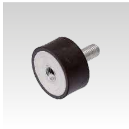
Vibration damper with external and internal thread