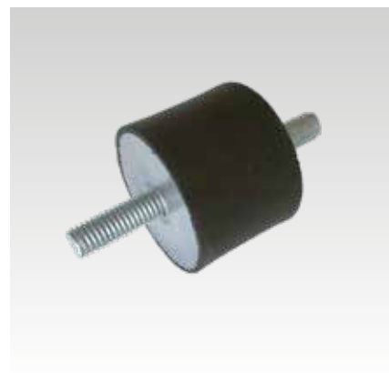
Vibration damper with dual-sided external thread