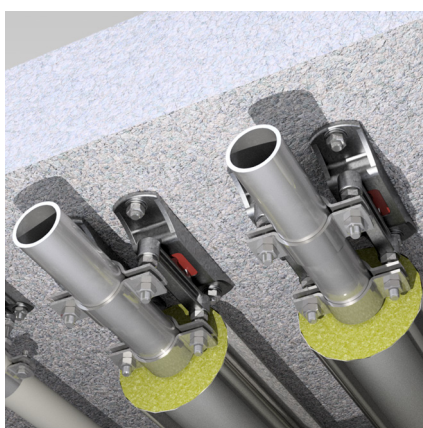
Vibration-decoupled water pipe anchor points