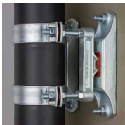
Down-pipe support for all pipe types vibration-decoupled