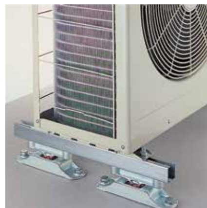
Vibration-decoupled support for equipment