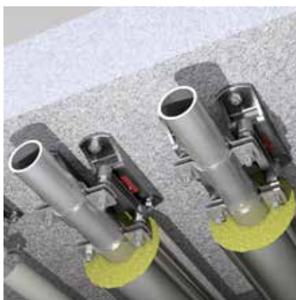
Vibration-decoupled water pipe anchor points