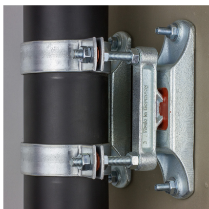
Down-pipe support for all pipe types vibration-decoupled