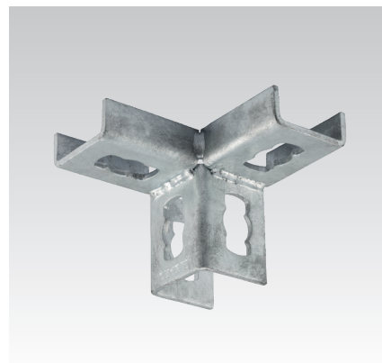
MPR-Corner connector right type S+1