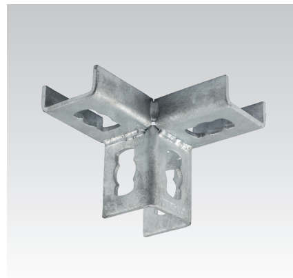
MPR-Corner connector left type S+1